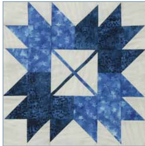
Block 7 was taken from issue #7 of Quilters Newsletter (May 1970) where it was identified as Maple Leaf.

Parts one through six of Ooh-Rah can be seen at www.QuiltersNewsletter.com .