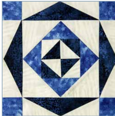
Block 6 was taken from issue #12 of Quilters Newsletter (October 1970) where it was identified as Framed Squares.

The Quilted in Honor fabric comes in many colors, shades and prints. Feel free to choose whichever you prefer.