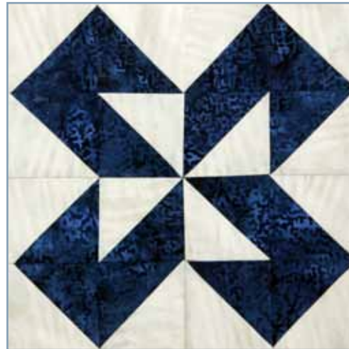
Block 2 was taken from issue #2 of Quilters Newsletter (December 1969) where it was identified as The Colorado Quilt block, which came from a 1941 Kansas City Star pattern.