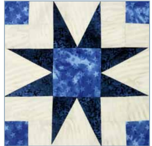
Block 11 was taken from issue #8 of Quilters Newsletter (June 1970) where it was identified as Star in Space.

Parts one through ten of Ooh-Rah can be seen at www.QuiltersNewsletter.com . The complete yardage is listed in part one.