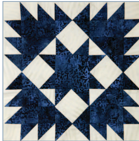
Block 10 was taken from issue #3 of Quilters Newsletter (January 1970) where it was identified as The Delectable Mountains.

The Quilted in Honor fabric comes in many colors, shades and prints. Feel free to choose whichever you prefer.